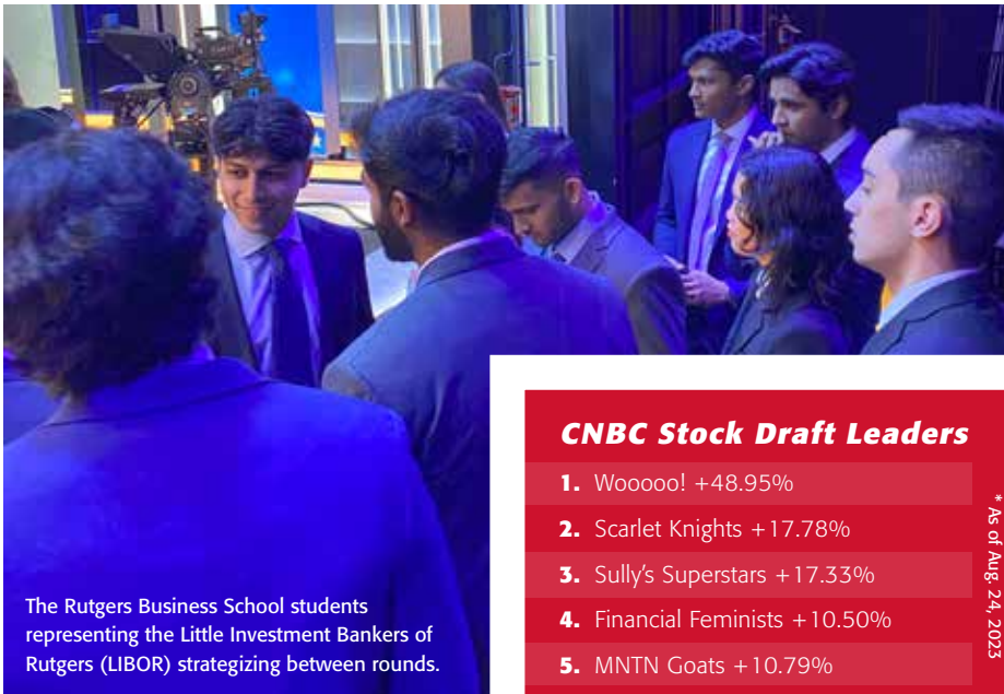
The Rutgers Business School students representing the Little Investment Bankers of Rutgers (LIBOR) strategizing between rounds.