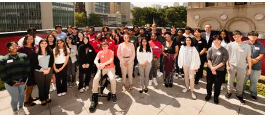
Forty-five students from high schools across the region attended the Supply Chain Management High School Summer Program.

"The earlier in a student's life that we can educate and inform them," he said, "the better chance they will have at making the right decision for college and picking a major."