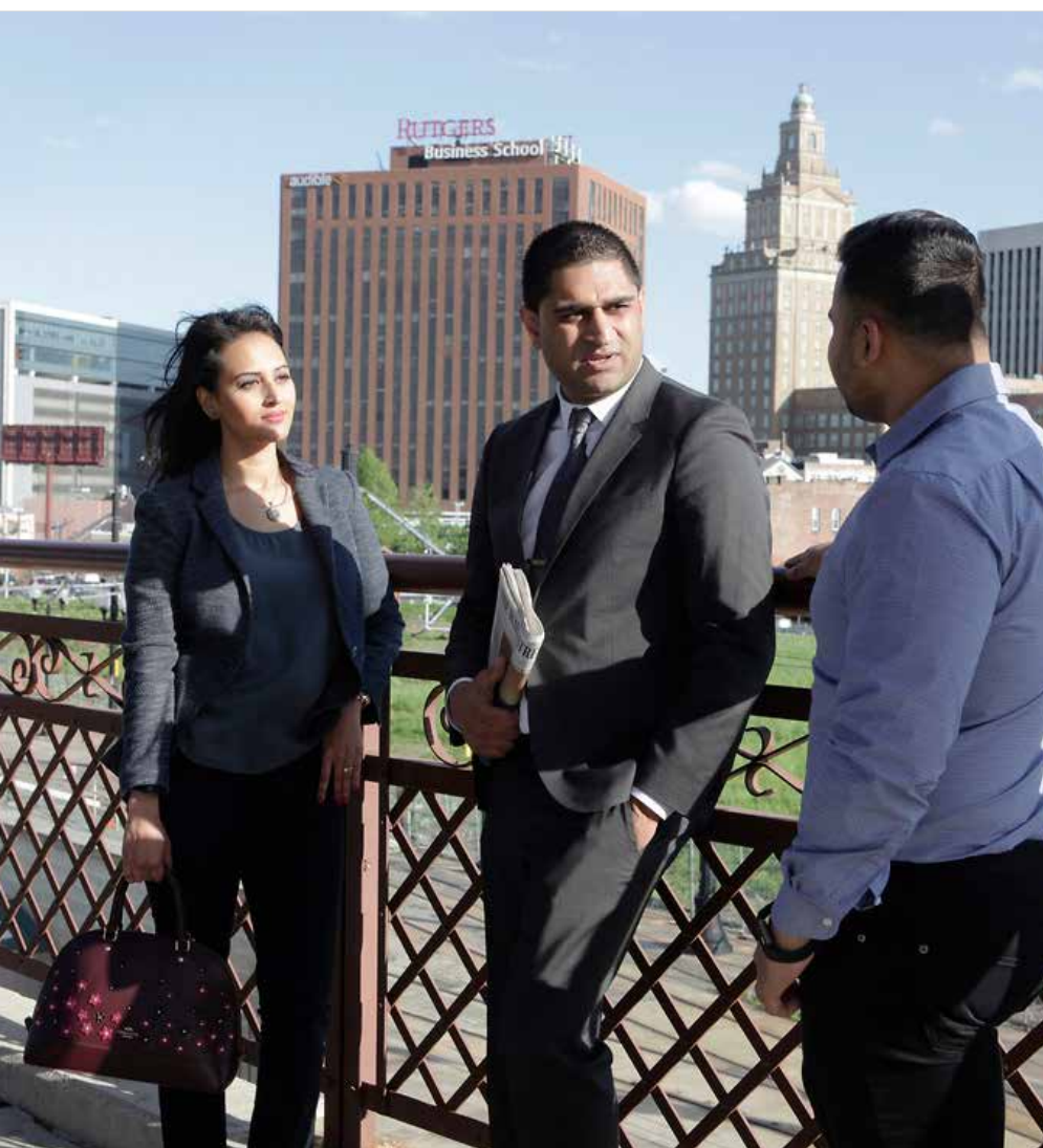
Rutgers MBA students at the Newark Broad Street Train Station heading to the financial capital of the world, only a 20-minute train ride to New York City.