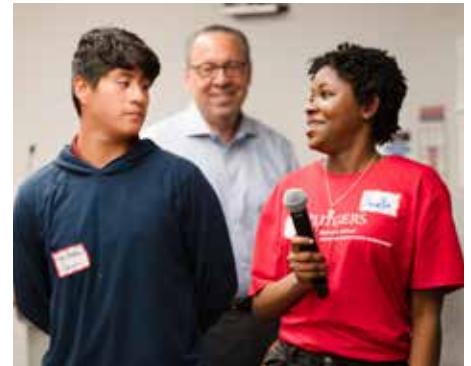
Students present their plan for creating sources of sustainable agriculture in Newark.