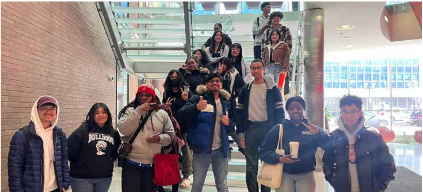
Students from the 2023 RBS PREP Program in Newark.