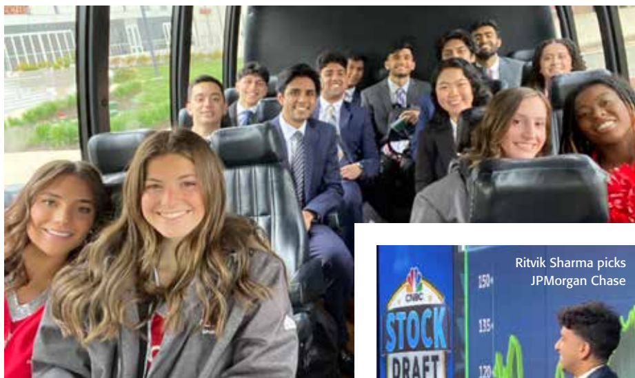
The students arrive at the CNBC global headquarters in Englewood Cliffs, NJ.