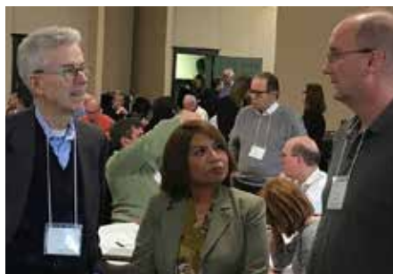
The governmental accounting and auditing conference at Rutgers offers students in the Master of Accountancy in Governmental Accounting a chance to meet leaders in public financial management.

The Master of Accountancy in Governmental Accounting is the only program of its kind in the U.S. available entirely online. The program was recently ranked the No. 5 best online master’s in business program for accounting in the nation, according to U.S. News & World Report . Courses are taught by industry leaders, and the 30 required credits can be completed part-time around a full-time job.