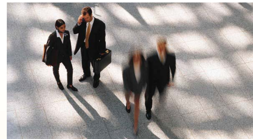
Top Employers of RBS: (in order of multiple offers)