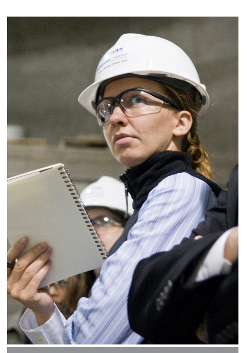
Supply Chain Management student on a recent industry sponsored visit to the Port of Newark, New Jersey.