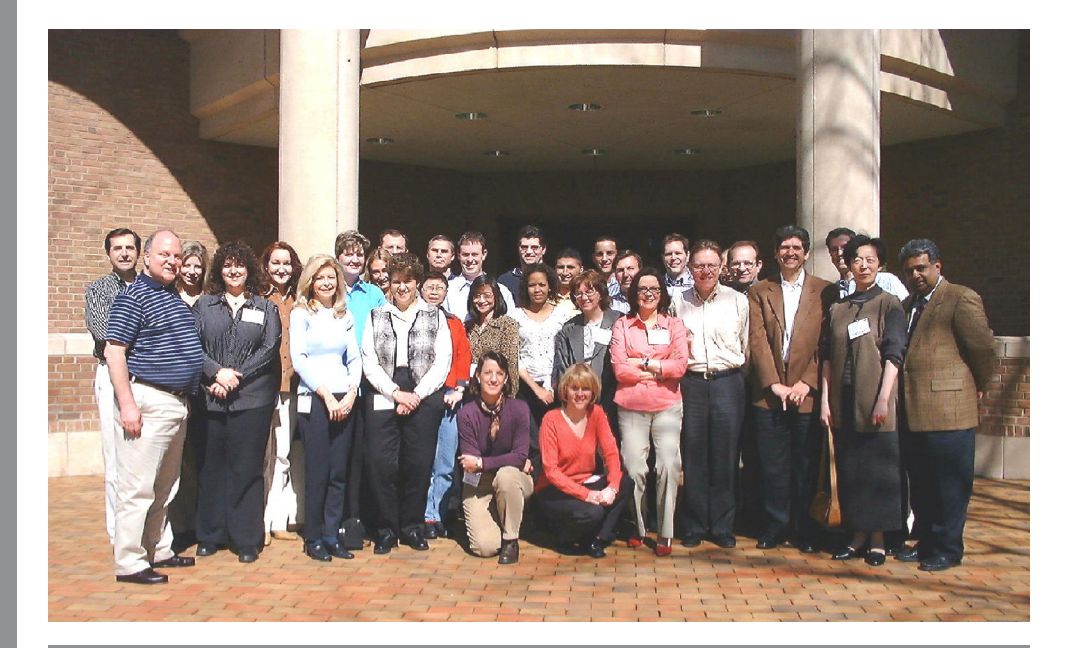
Attendees leave the Supply Chain Management certificate program ready to execute a supply chain management plan grounded in today's business needs.

faculty and top senior executives from local corporations, participants learned how to execute a supply chain management plan that is grounded in today's business needs for competitive effectiveness and operations efficiency. The program has consistently received outstanding evaluations from its attendees and was a major success this year with over 29 attendees.