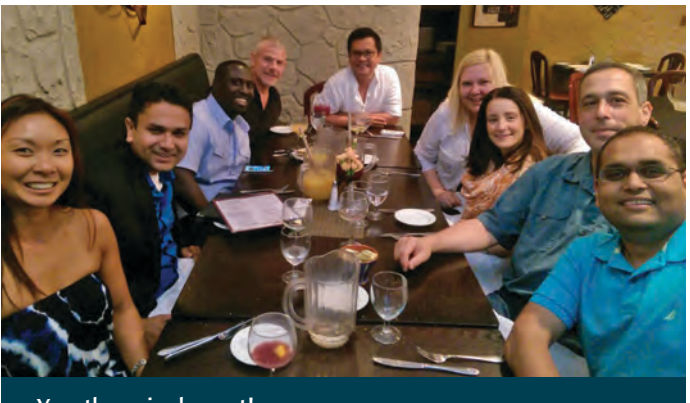
Yes, there is dessert!