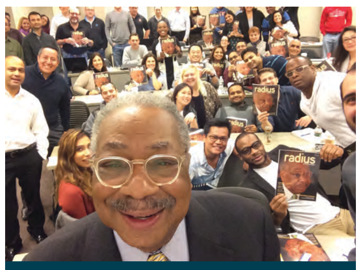
Immortal Selfie of an Immortal Man.

Outside in the howling darkness, the wind screamed and beat at the French doors. The golf course was a black churning sea of waves, and the Mercedes slid inexorably into the muddy waters of newly-created Lake Shackamaxon. But nobody cared. Nobody noticed. We were back with 'family'; back in The Powerhouse, and nothing else mattered.