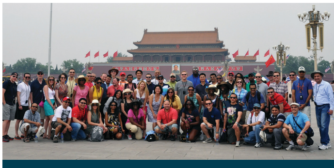
Rutgers EMBAs in China

The 10 day, three-credit summer seminar in China continues to do extremely well. In many ways, this is one of the highlights of the whole program. Rutgers EMBAs stay in 5-star hotels, such as the Peninsula Hotel