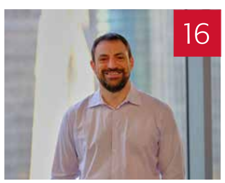
NBA executive finds a way to grow career with Rutgers