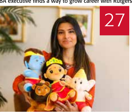
Alumna's marketing savvy helped to build niche toy company.