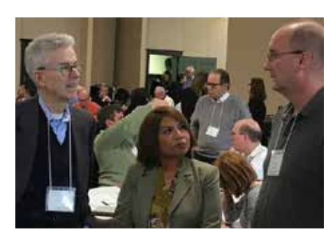
The governmental accounting and auditing conference at Rutgers offers students in the Master of Accountancy in Governmental Accounting a chance to meet leaders in public financial management.

The Master of Accountancy in Governmental Accounting is the only program of its kind in the U.S. available entirely online. The program was recently ranked the No. 5 best online master's in business program for accounting in the nation, according to U.S. News & World Report. Courses are taught by industry leaders, and the 30 required credits can be completed part-time around a full-time job.