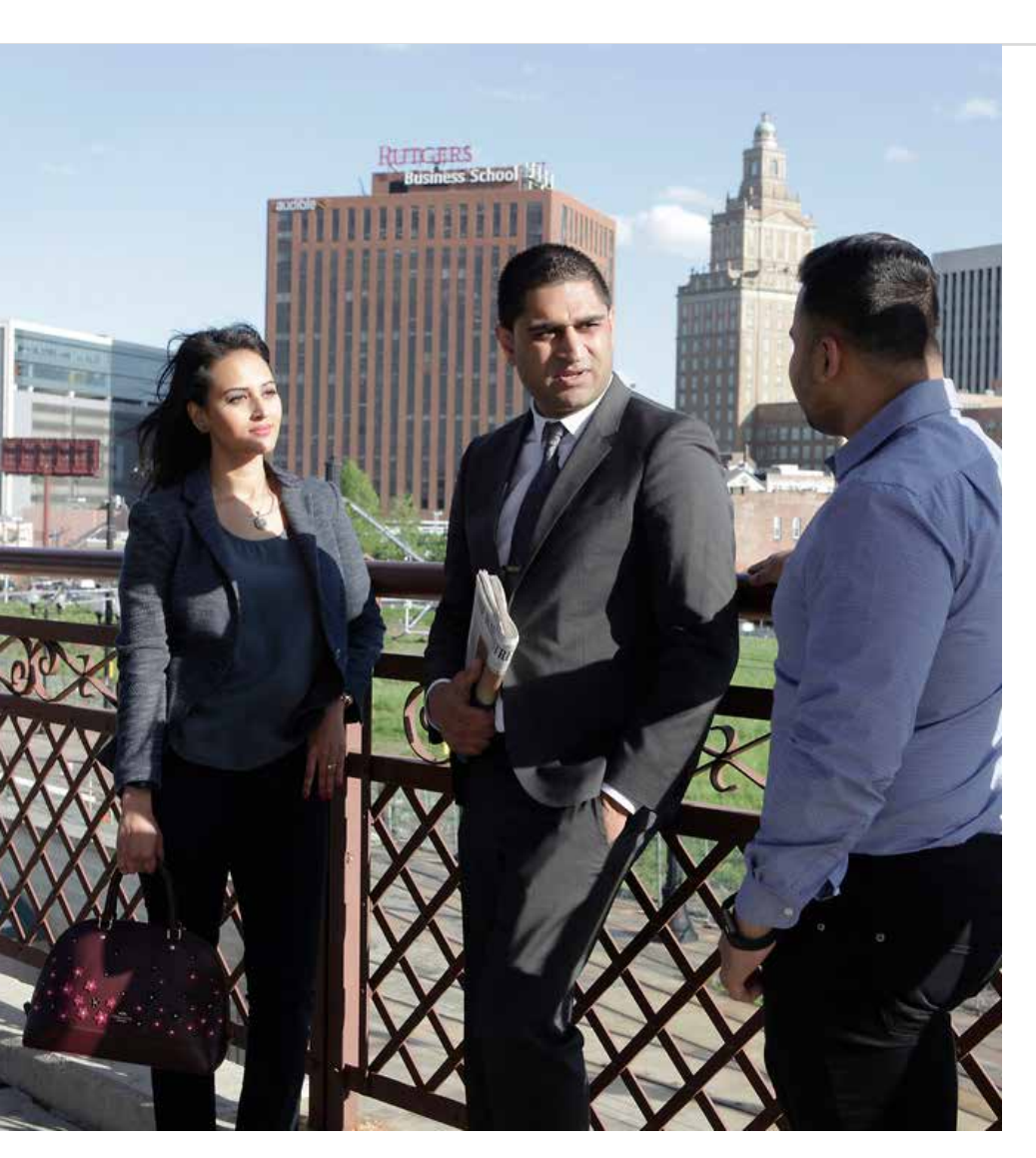
Rutgers MBA students at the Newark Broad Street Train Station heading to the financial capital of the world, only a 20-minute train ride to New York City.