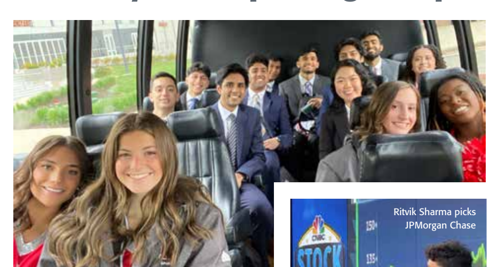
The students arrive at the CNBC global headquarters in Englewood Cliffs, NJ.